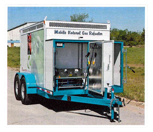
The highest capacity, lightest weight transports on the market

Home About Us Products Comparison News FAQs Contact Us