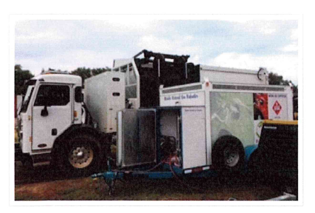
The only DOT/TC approved mobile CNG refueler POWERED BY