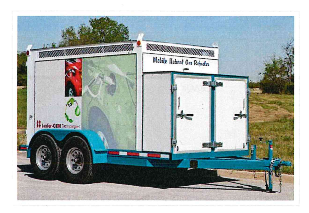
Towable behind a standard 3/4 ton pick-up