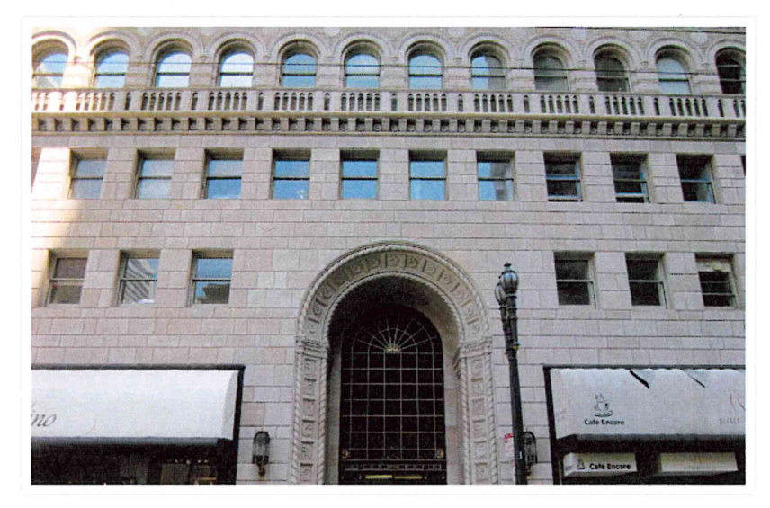
Luxfer-GTM Technologies is located in San Francisco, CA

Home About Us Products Comparison News FAQs Contact Us