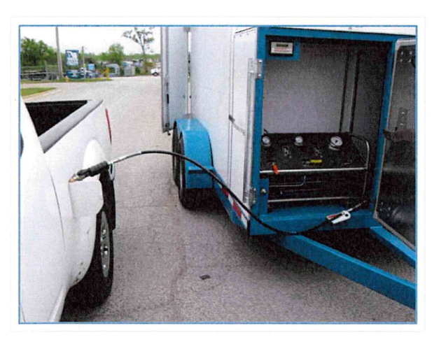
Comes complete with fill hose and NGV1 fill dispensing nozzle

"A breakthrough in mobile CNG refueling and distribution."